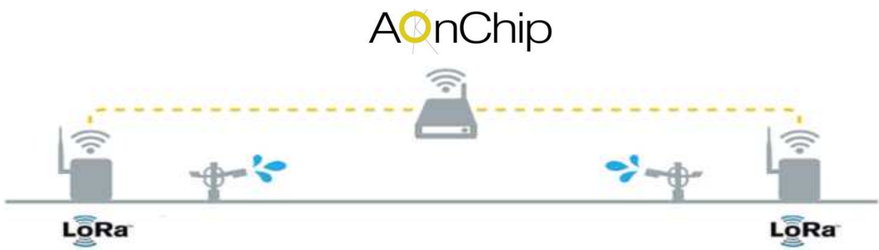
parks and gardens