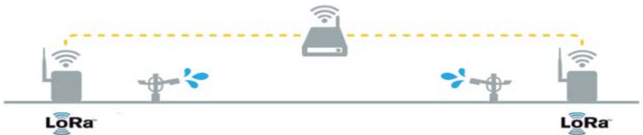
parks and gardens